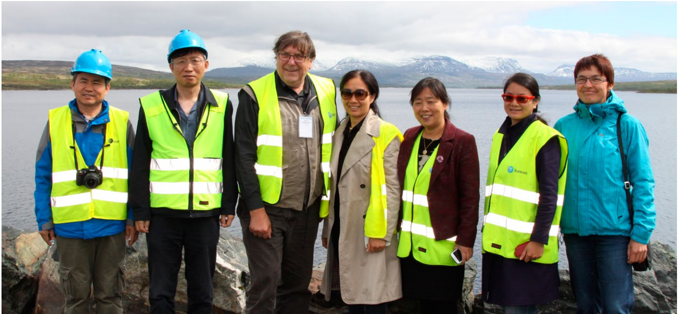
The Chinese delegation participating in CEDREN's project FutureHydro (see CEDREN Abroad page 24) were among the participants on the Ecohydraulics excursion to the River Nea.

The implementation of results from CEDREN will remain one of the main tasks for the coming two years – a task we hope our user partners from industry and management will engage in – putting into effect improved methods and knowledge to ensure that renewable energy is respecting the nature.