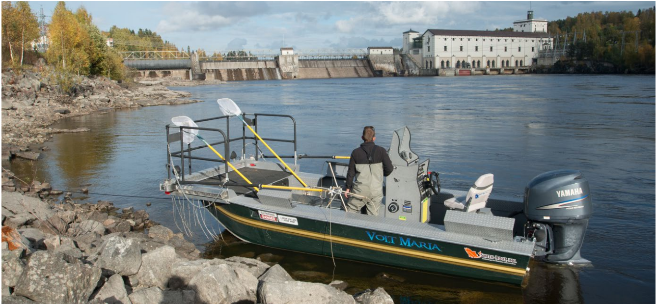
Electro-fishing boat downstream of Rånåsfoss Power Plant in Glomma.