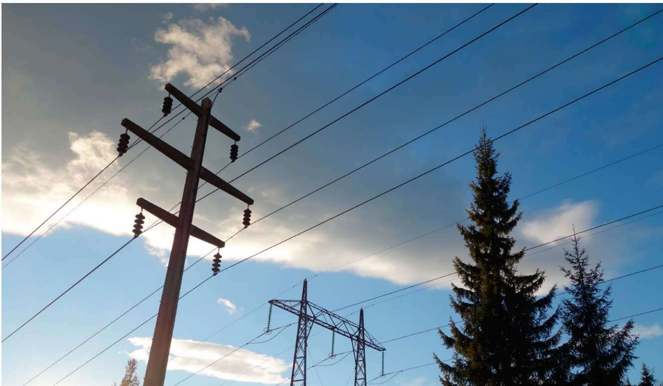
Balbergskaret in Lillehammer.

Successful workshop in London ■ In November 2014, the findings from SusGrid were presented at a workshop in London that organised in cooperation between University of Exeter and CEDREN. Here researchers, grid owners, the authorities, non-governmental organizations and other interested parties from all over Europe came together to discuss the challenges regarding participation and acceptance by local people in grid development processes. We also held a similar workshop with Norwegian user partners in Oslo.