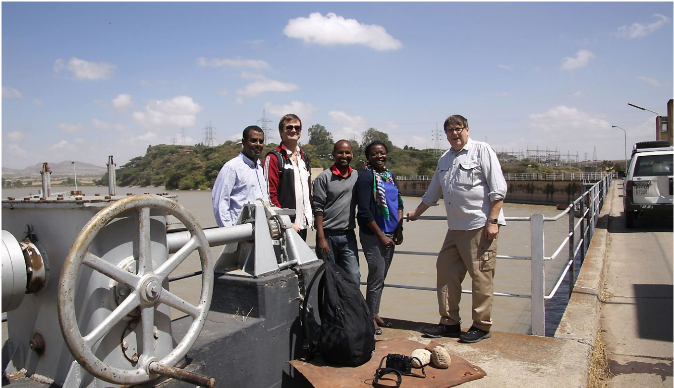
CEDREN-researchers at the Koka dam, Ethiopia.

The 'United Nations Framework Classification for Fossil Energy and Mineral Reserves and Resources 2009 (UNFC-2009)' will now be extended to include renewable energy. A working group has been working on a revision of the classification, so that it can also be used for renewable resources such as hydro, solar and wind energy. CEDREN's Ånund Killingtveit was invited to join this task on the suggestion of the IHA.