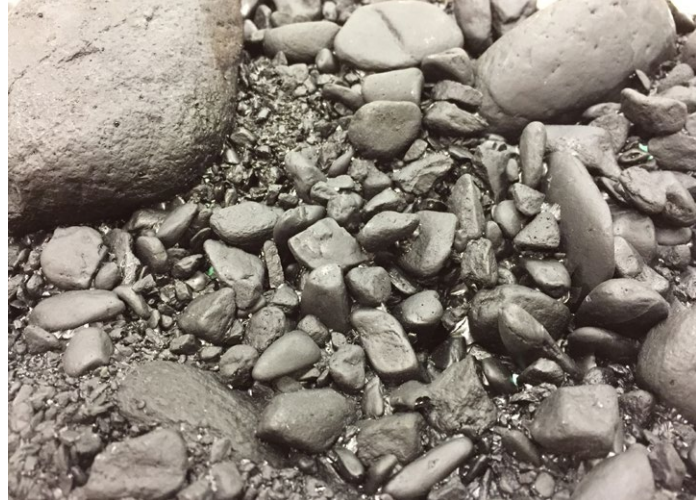
Close up of the artificial riverbed.

Scientists from the Technical University of Munich took a section of riverbed home to Germany after participating in a workshop organised by CEDREN, and are currently developing a 3D model of the bed.