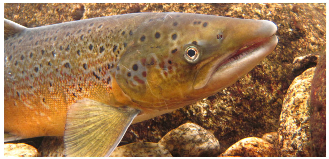
Female salmon are selective when choosing where to spawn. Researchers in the EnviDORR project have discovered ways to enhance reproductive conditions for salmon – such as adding gravel to their spawning grounds.

learning opportunity. The energy companies learn about biology and we have learned about the framework within which they operate. Now we speak the same language," says Forseth.