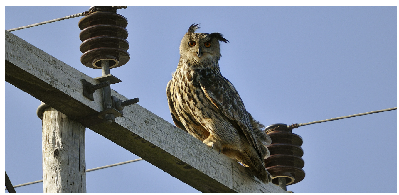
Eagle owls are frequently resting at the power line pole cross arms, exposing themselves for electrocution hazard.

recognise if birds found dead beneath the power line come from the population. The corridor is regularly patrolled to find any birds killed by flying into the line. The project has bought and trained a dog to assist during the dead bird searches.