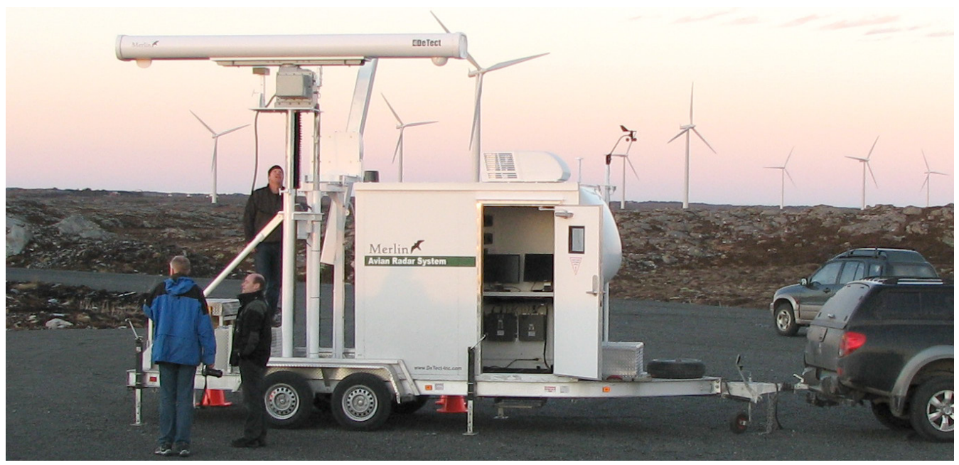
In March 2008 the BirdWind Project started to collect bird data on Smøla using the Merlin radar system at the picture. The experience acquired by the radar ornithologists is crucial also for the operation of a new car mounted 3D radar system.

The BirdWind researchers tested and calibrated the radar using a model airplane that was roughly the size of a white-tailed eagle and manoeuvred to mimic its flight. A German research project hired BirdWind's model airplane and pilot to calibrate its own radar as well.