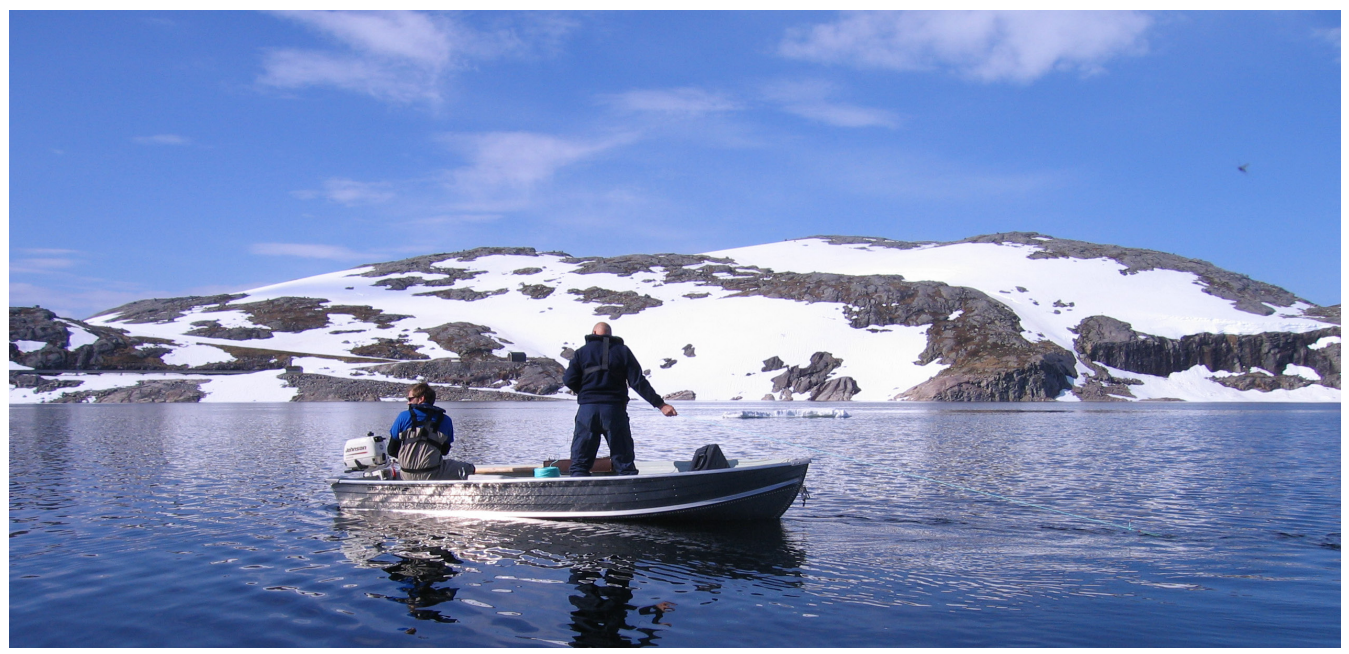
Norwegian hydro reservoirs have 90 TWh of storage capacity and can use parts of this for balancing European renewable energy.

can expect similar balancing needs with the UK and other European countries too," says Harby.