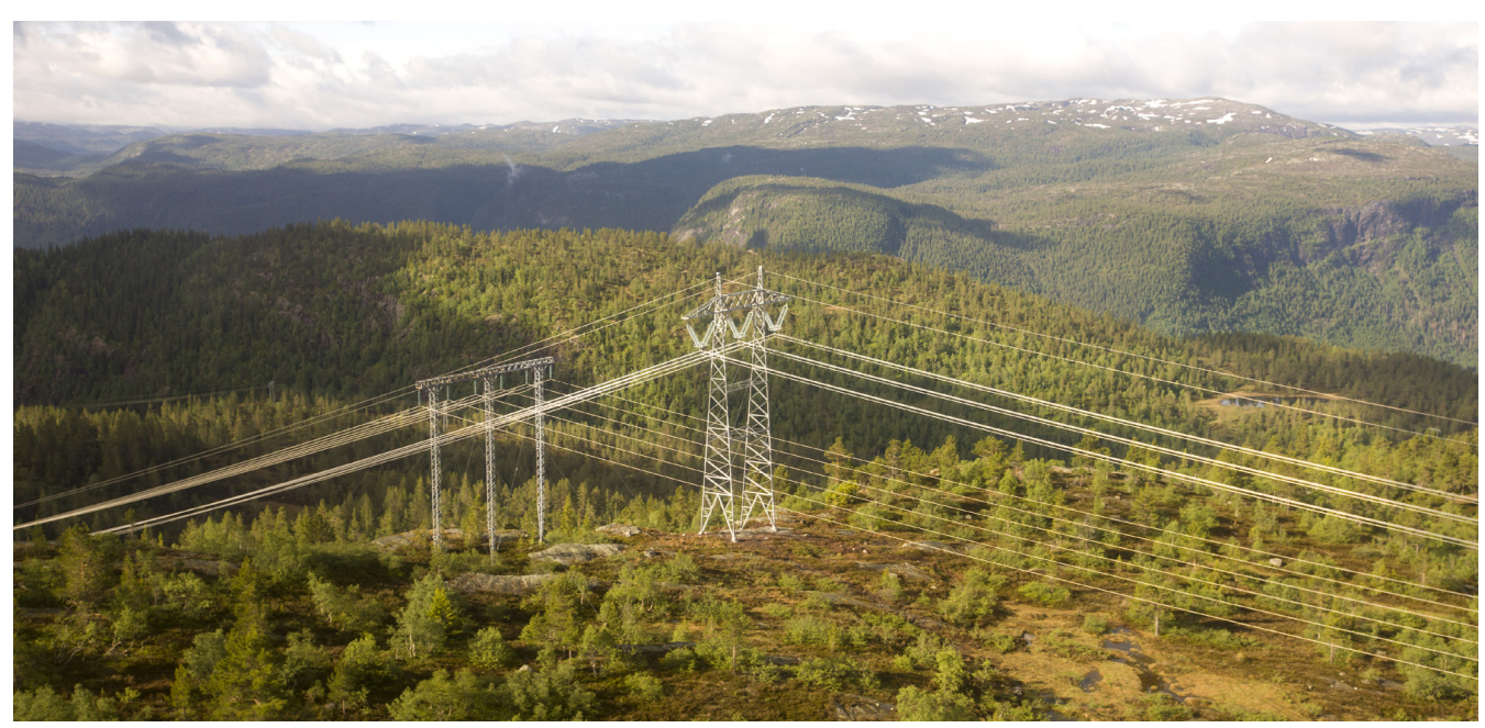
CEDREN studies provide knowledge for improved planning tools and governance procedures facilitating public acceptance and consensual realization of grid projects.

are not completely well-suited to today's society; many of them focus just as much on media comments and the social media as on the established, formal processes."