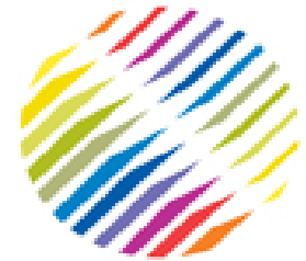
European Research Area